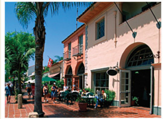
▲ World-class shopping awaits you at Santa Barbara's beautiful Paseo