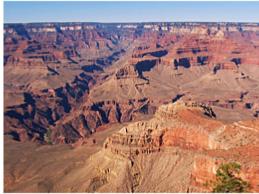
The Grand Canyon ▲

One of America's great art and culinary capitals. Choose from: World-renowned art galleries, shops and museums • Walking tour of the plaza • Institute of American Indian Arts • Museum of Fine Arts' Georgia O'Keeffe Collection • Tour an artist's home and studio • Overnight on the GrandLuxe Express (B,L,D)